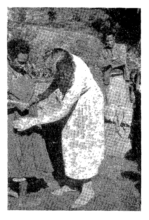
Gifts from the Dorcas societies have been of inestimable worth. Here we see natives in the New Guinea highlands being fitted with clothing from the Dorcas parcels.

We have tried all sorts of ways to bridge the gap. The two teachers' wives and I have cut up coats and resown them as blankets, but it takes a long time for us