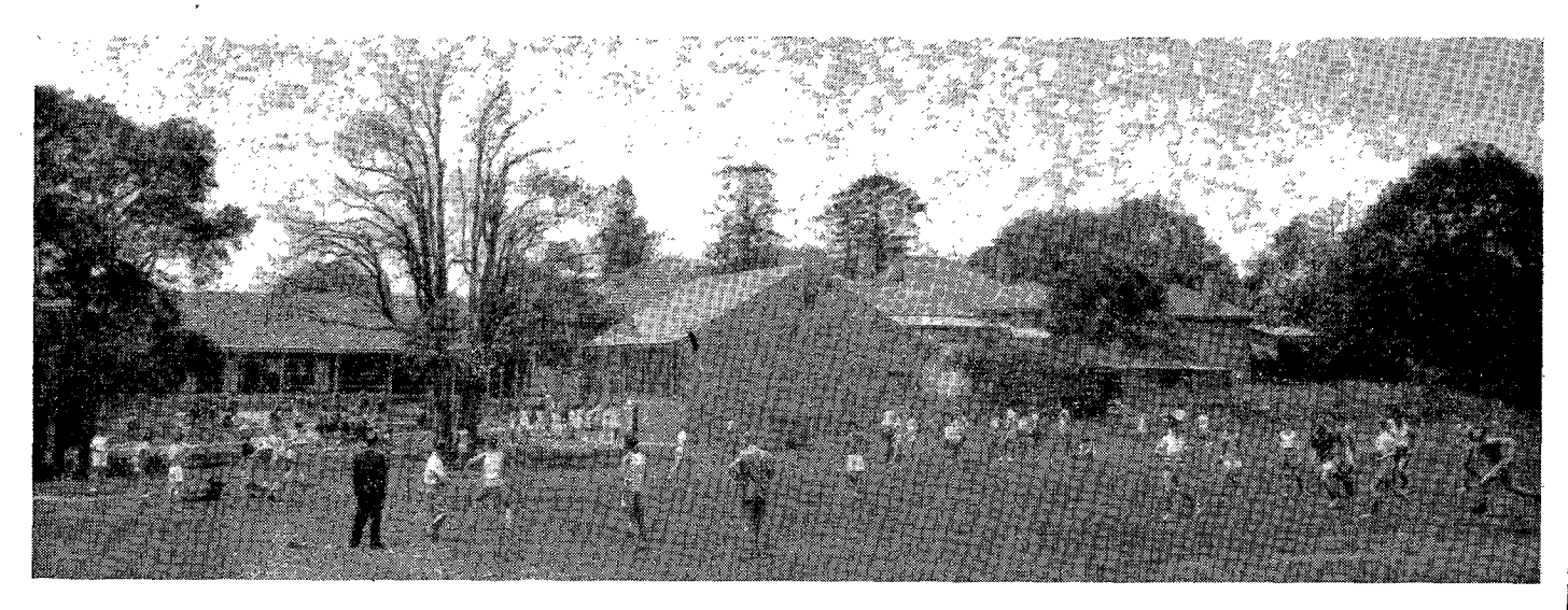
STRATHFIELD HIGH SCHOOL, SHOWING THE SPACIOUS PLAYING FIELDS.

Seventh-day Adventists are represented among the five denominations listed as members of the National Committee and our Temperance Department is wholeheartedly supporting this educational venture. As Secretary of this National Committee it has been my privilege to