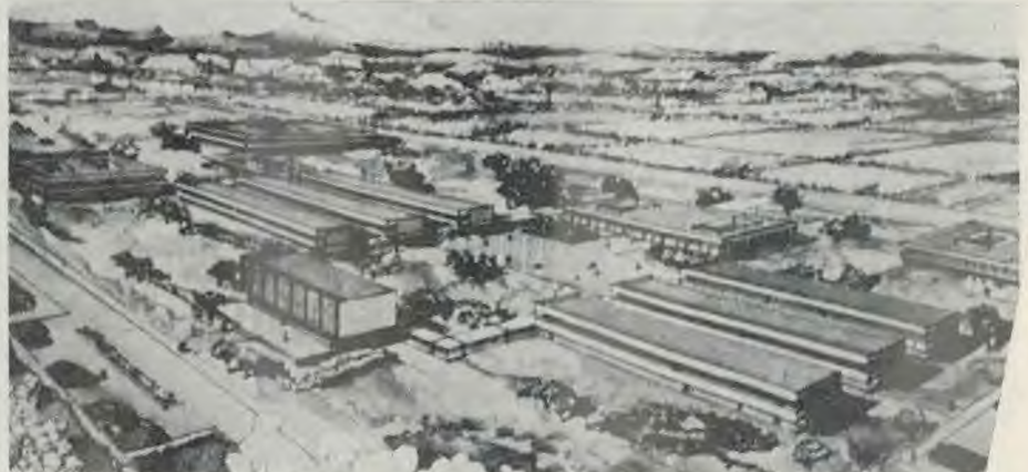
The newly-created Universidad de Montemorelos will include schools of theology, business, nursing, education and medicine. The medical school will open in September, 1975.