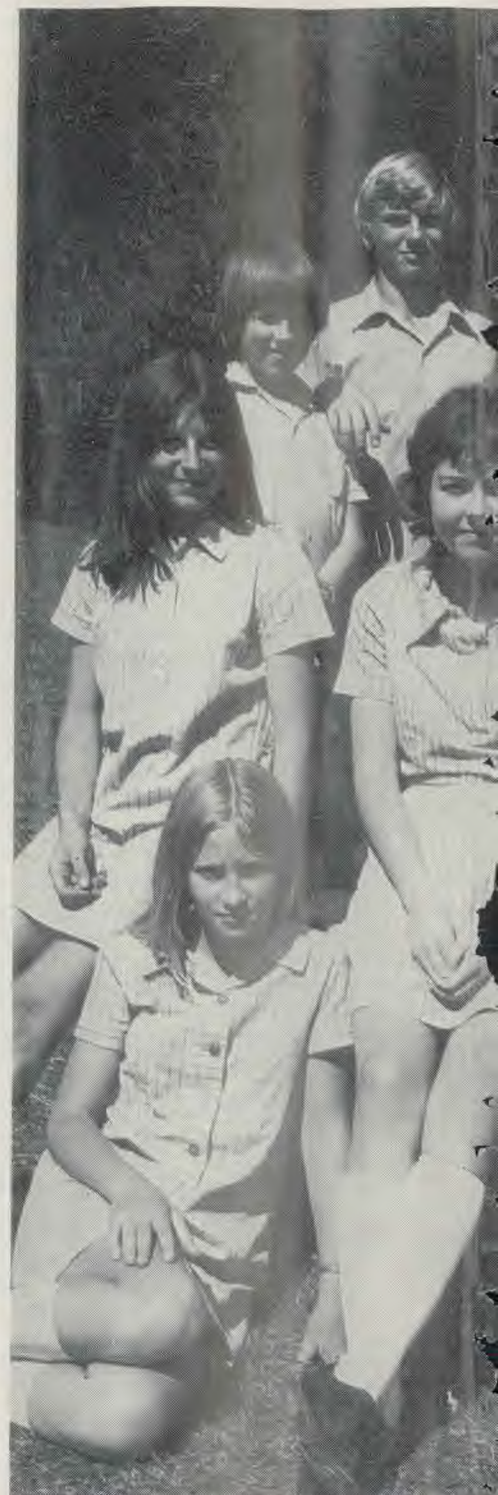
Some of the high-school students who attend the Central Coast Adventist School.