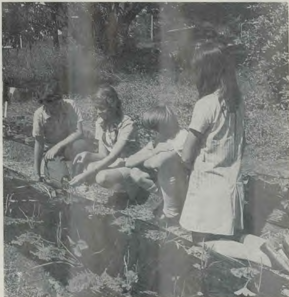
School students examine newly planted strawberries.