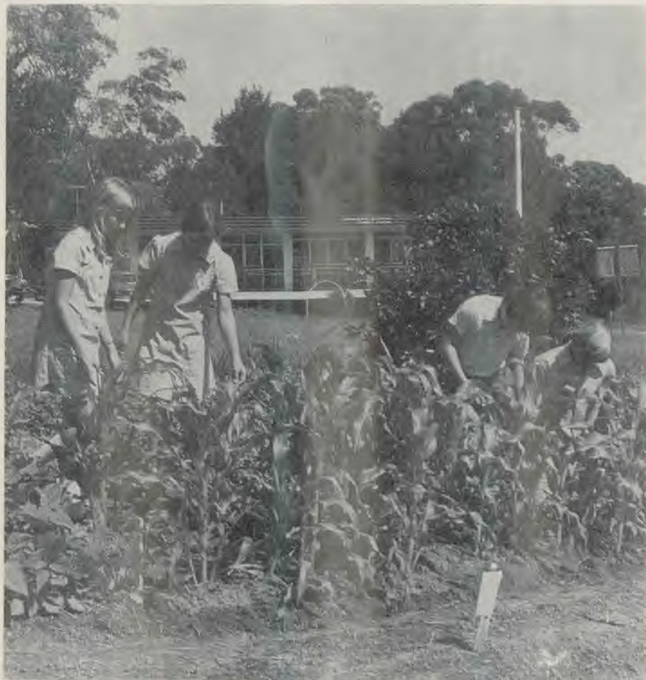
High school students in experimental garden. The primary school is in the background.

Of course, like all Adventist schools, this one aims at a standard of academic education equal to that of the public schools. In addition, emphasis is placed on the teaching of Bible subjects and character