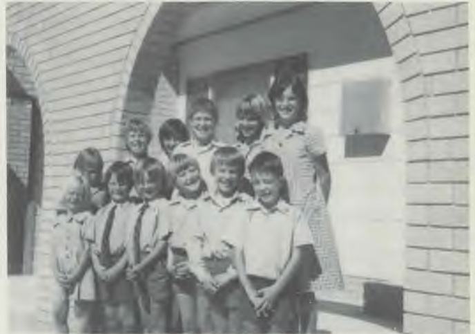
Christian education is flourishing in Esperance. These twelve pupils are the church's pride and joy.