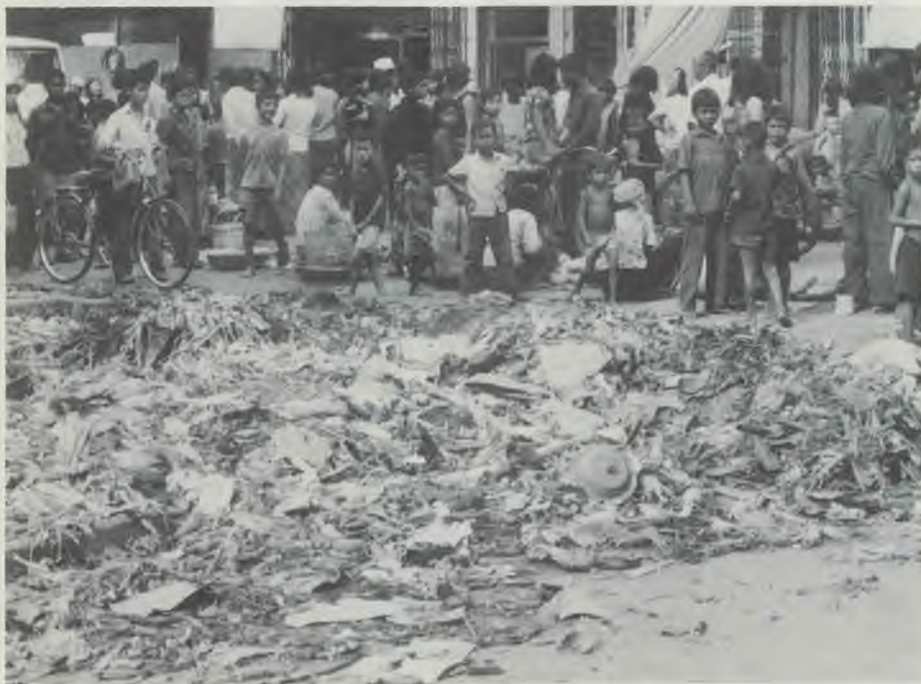
Piles of rubbish in the streets of Phnom Penh. SAWS is providing equipment to help clean up the city.

This second quarter of 1981 the world church is turning its eye toward the Far