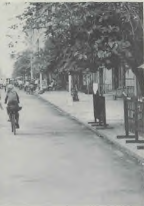
Kampuchea (Cambodia). There is still evidence that beautiful city.