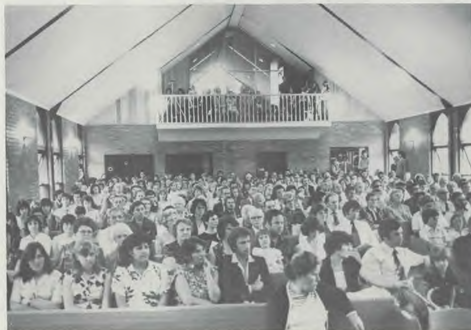
Over 400 people attended the opening ceremonies. Even the small balcony was filled.

AN EIGHT-YEAR DREAM came to reality on Sabbath, March 28, with the opening and dedication of the new Seventh-day Adventist church in Hull Road, Lilydale.