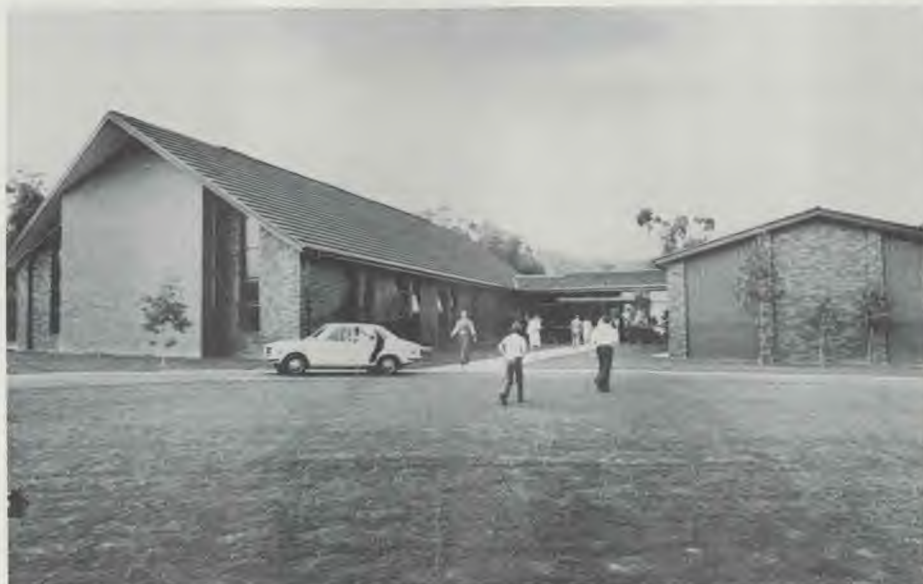
A front view of the recently opened Lilydale church complex.