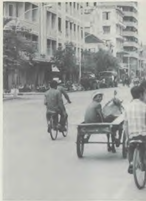
A present-day street scene in downtown Phnom Penh this was one

We have a proposal now before the authorities in Thailand to supply student