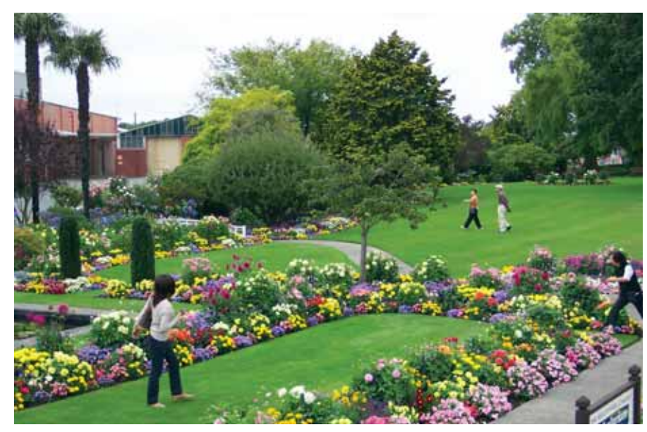
The award-winning gardens at the Sanitarium factory in Christchurch, New Zealand, have become a popular feature of the city.