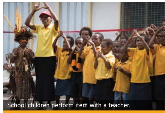
School children perform item with a teacher.