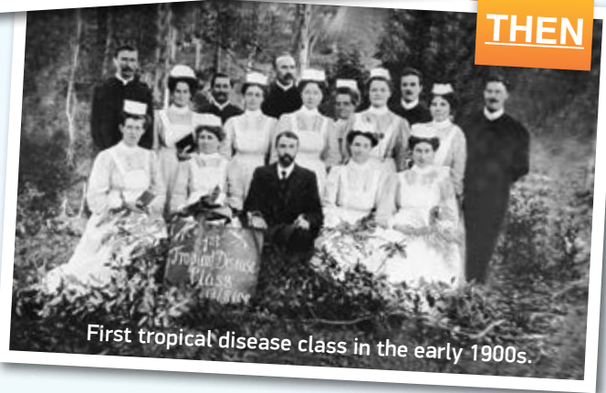
First tropical disease class in the early 1900s.