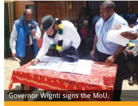
Governor Wingti signs the MoU.

He said he wanted to make Paglum a model school, not only in the province but in the country. — Jim Wagi