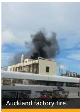
Auckland factory fire.