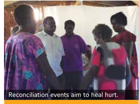
Reconciliation events aim to heal hurt.