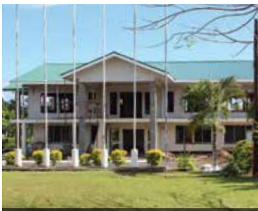
Office during rebuilding work.

The Prime Minister of Samoa and the deputy head of State attended to reopen the building. The Prime Minister commended Mission leadership for their sacrificial service. The dignitaries noted that the Mission chose to focus on rebuilding churches and other areas of need, leaving the Mission office till later. This quiet witness and priority was noted by country leaders and a witness to the people of Samoa. Thousands of people, including dignitaries from the Trans-Pacific Union Mission and other churches were present. — Wayne Boehm/TPUM Newsletter