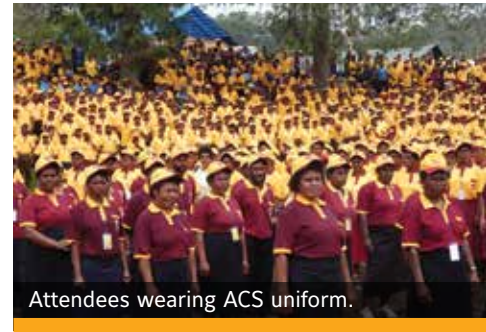
Attendees wearing ACS uniform.