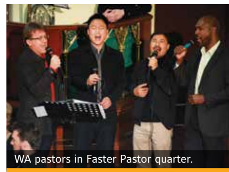
WA pastors in Faster Pastor quarter.