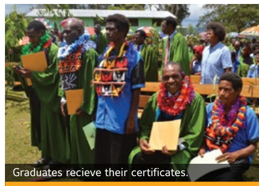
Graduates receive their certificates.