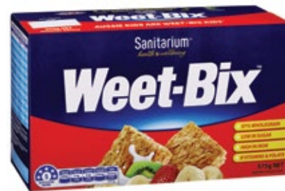
Weet-Bix now has new packaging.

Consumers can find Health Star Ratings for Sanitarium products on the Sanitarium website, visit < www.sanitarium.com.au/health-and-wellbeing/health-star-rating >.