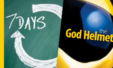
How nature observes God's Sabbath