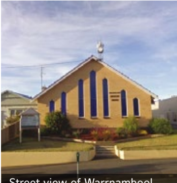
Street view of Warrnambool.

If you love the coast or have always wanted to see The Twelve Apostles-one of the world's most picturesque natural attractions-then a holiday along the Great Ocean Road in Victoria might just be for you. If you are in the area for Sabbath, then you must pay a visit to Warrnambool church. According to long-time member Barry Ladlow, it's an active and multicultural church with about 45 regular members and up to 80 attendees on some Sabbaths.