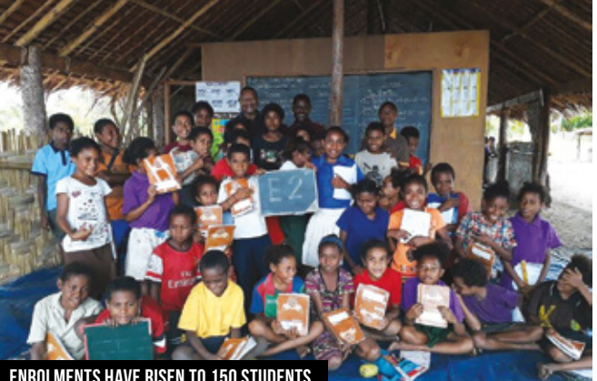
ENROLMENTS HAVE RISEN TO 150 STUDENTS

On the first day of the temporary "bush school" more than 120 children and two Seventh-day Adventist teachers were ready to commence the school year.