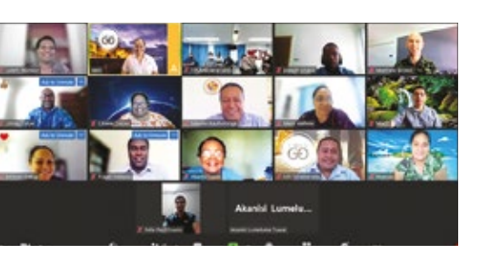
The online training was conducted by South Pacific Division's Adsafe team.