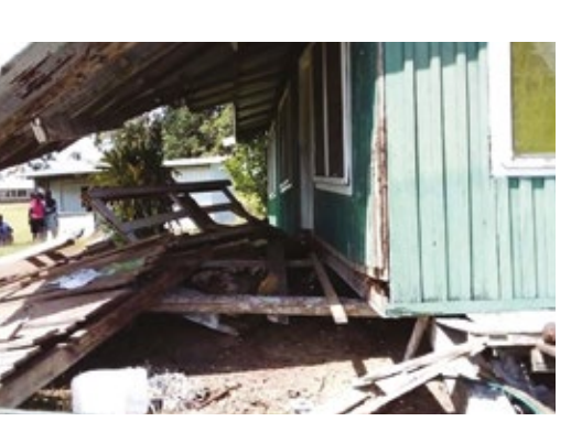
The principal's house is off its stilts and has sustained major damage.

Discover Your SHAPE equips members to make disciples according to their strengths and areas of interest.