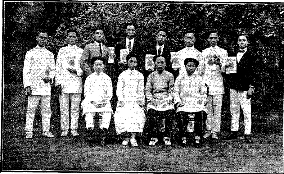
Colporteurs, Singapore Training School

At Kuala Lumpur our Chinese worker has taken many subscriptions for the Chinese Signs , and the