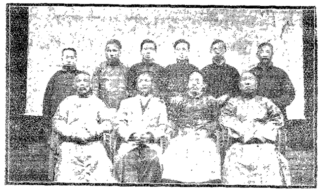
Teachers in Boy's School, Foochow

All were interested in listening to six of the more advanced students in the Boys' Training School deliver short sermons on important Bible subjects. It was evident that they have some ability and had received careful training, which was supplemented by expe-The students in this school have an excellent