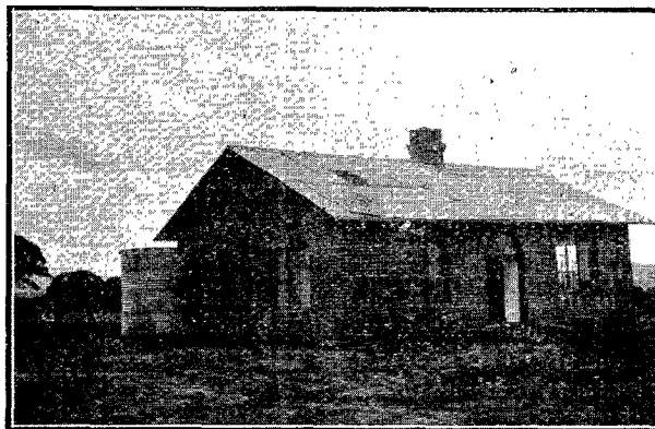
Hospital at Malamulo mission where so many patients are treated each day. What we collect in the Harvest Ingathering Campaign will greatly assist the medical work in Nyasaland

The conference has purchased a church building and our church will immediately do the needful repairing and effect such alterations as may be necessary. On