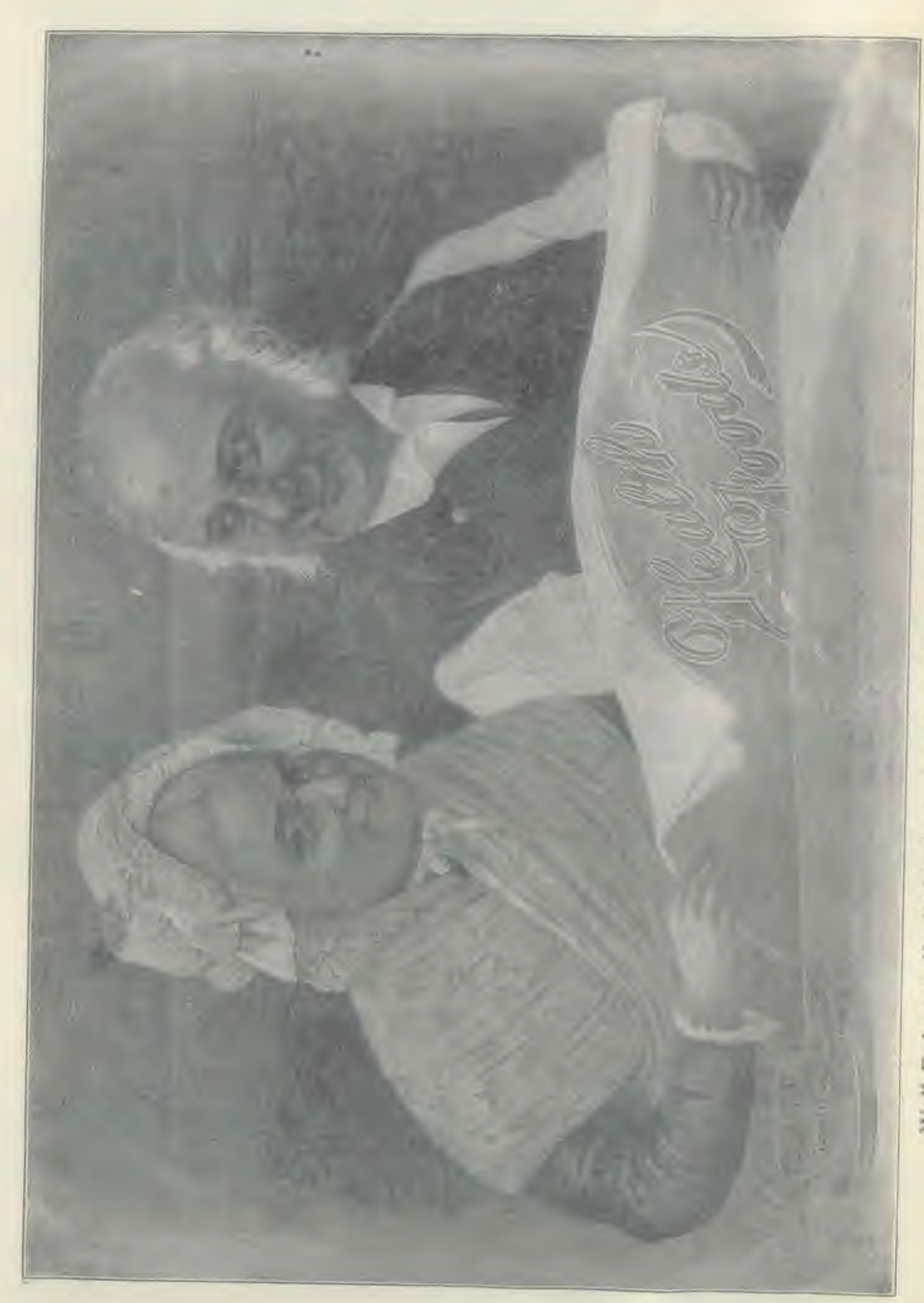
Well Fed upon Healthful Food, Consequently Young at past Seventy Years of Age,