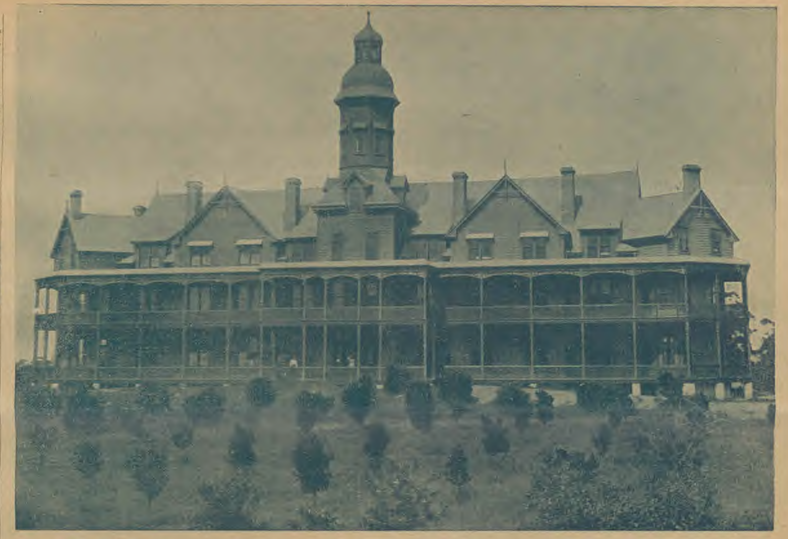
Wahroonga Sanitarium.—Just Opened for the Public; for Principles and Policy, see Articles on page 42 and Elsewhere.