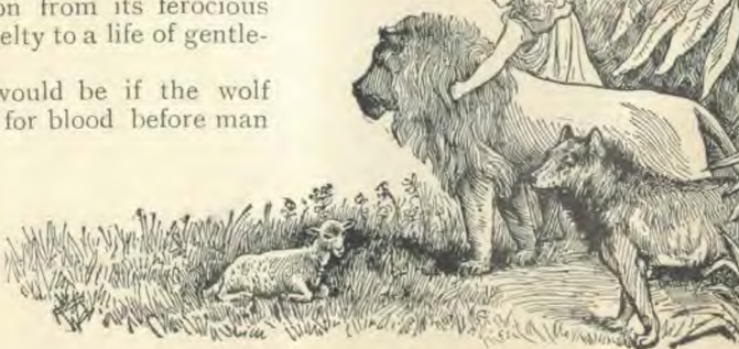
A LITTLE CHILD SHALL LEAD THEM.

A FEW minutes spent in vigorous breathing exercises after each meal is one of the best means of remedying the sense of heaviness and weight of which so many complain after eating. The digestive processes may be promoted by this simple measure, and, if habitually practised, many chronic digestive ailments may be radically cured by the systematic and persistent practice of deep, full breathing.