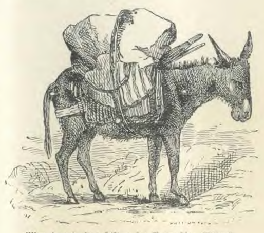
The Ass is too Wise to Chew the Weed.

If tobacco is good for men, it is also good for women. I do not suppose that one could find a man so low and degraded as to walk down the street with a woman who had a cigarette or cigar in her mouth. Women should make the same standard for men that men do for women. Many women would smoke in public if men did not denounce it. MEN WOULD QUIT SMOKING IN PUBLIC IF WOMEN DE-NOUNCED IT AS MUCH.