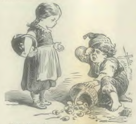
Happy Hours Murred by Toothwhy al Accident.

health, and without which the processes of fresh growth and development are stunted." "These mineral constituents," he goes on to say, "cannot be introduced into the system in an assimilable form except in organic combination with an albuminous molecule, and in such combinations they are found in sufficient proportion to meet the child's needs m / y in certain vegetables, fruits, and cereals."