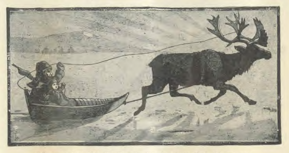
Whatever You May Do, Breathe Deeply of the Pure Atmosphere.

Always breathe slowly and deeply, inspirations being through the nostrils and expirations either through the nose or mouth. Inhalation may be accompanied by any part of an arm or shoulder exercise that will elevate and extend the thorax, such as raising the arms laterally, while that part of an exercise which tends to contract the walls of the chest should be accompanied by exhalation, as lowering the arms laterally from the shoulders or from over the head. Always fill the lower lungs first by forcing down the diaphragm, then as the arms are raised, expand the entire chest, allowing the air to get into every nook