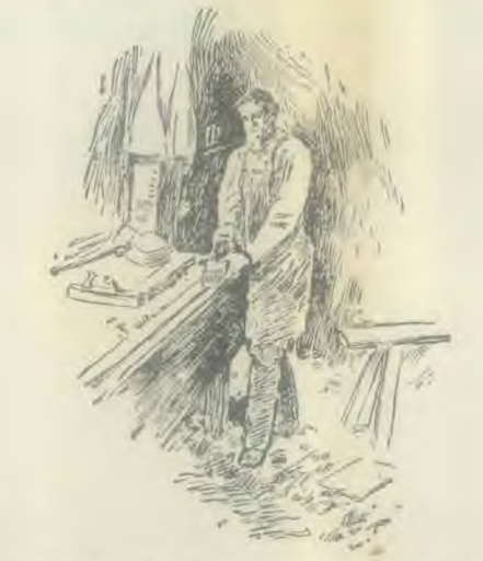
Exercise, an evenient thing, a necessity to man's well-being,

All this is true. The spirit of athletics is the spirit of competition; and competition—the effort of one man to outdo another, to wrest from that other a victory, a prize, an honor, that he wants—is not only an ethical injury, but is an irresistible temptation to over effort and strain. Exercise, when adapted to the strength and needs of the individual, is an excellent thing, a necessity to physical, mental, and