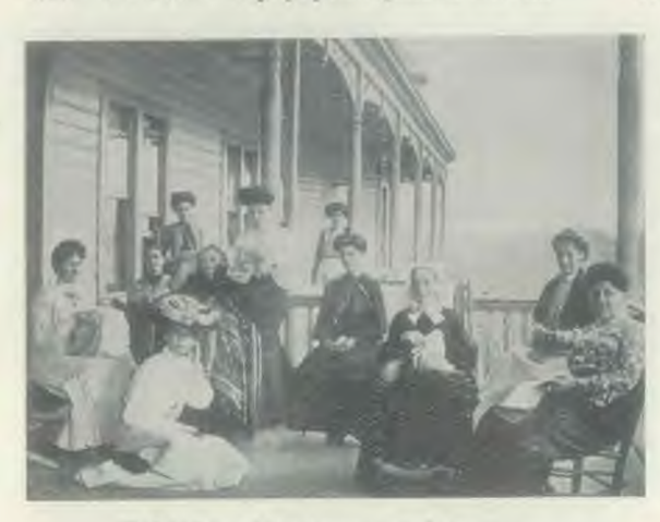
Patients at Wahroonga Sanitarium.

Bread and cereals digest well when taken together: fruits and nuts also combine well: meat combines but poorly with any other food. If a dyspeptic is going to eat meat, he should adopt the Salisbury system and eat meat only. An exclusive meat diet is far easier of digestion than is a mixed diet, but the after results are bad. An exclusive milk diet often agrees well with invalids. Dyspeptics placed on an