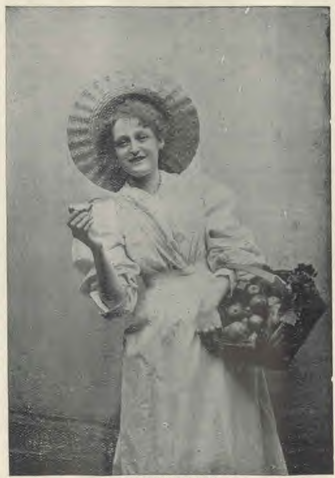
THE FRUIT CURE.

THERE is one sure cure for the drinking disease or habit. The cure consists in eating fruits. It will cure the worst case of inebriety that ever inflicted a person. It will entirely destroy the taste for intoxicants and will make the drunkard return to the thoughts and tastes of his childhood when he loved the luxuries nature had provided for him and when his appetite had not become contaminated by false, cultivated tastes and attendant false desires and imaginary pleasures. No person ever saw a man or woman who liked fruit and who had an appetite for drink. No person ever saw a man or woman with an appetite for drink who liked fruit. The two tastes are at deadly enmity with each other, and there is no room for both of them in the same human constitution. One will certainly destroy the other. One brings health, contentment, and moral desires. The other brings disease, misery, and immorality. It is for the person to choose which of these tastes, with