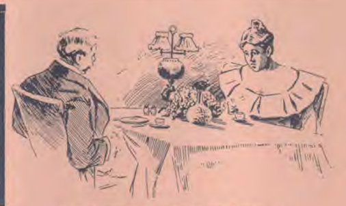
"Diet cures mair than doctor."

GRANOSE Has no equal as a Health Food. It is a Complete Food, containing all the elements of nutrition. It is Food for Babies. It is Food for Invalids. It is Food for All.