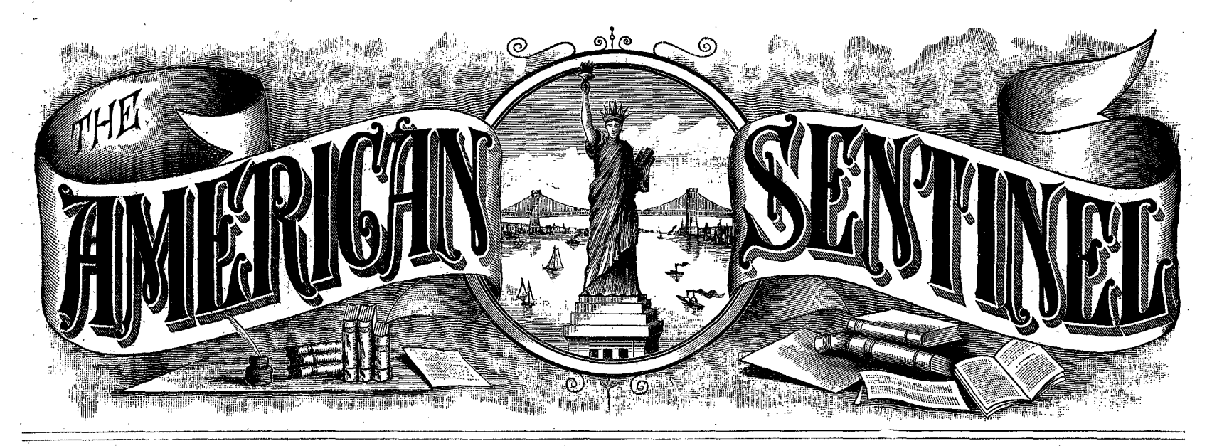
Equal and exact justice to all men, of whatever state or persuasion, religious or political. — Thomas Fefferson.