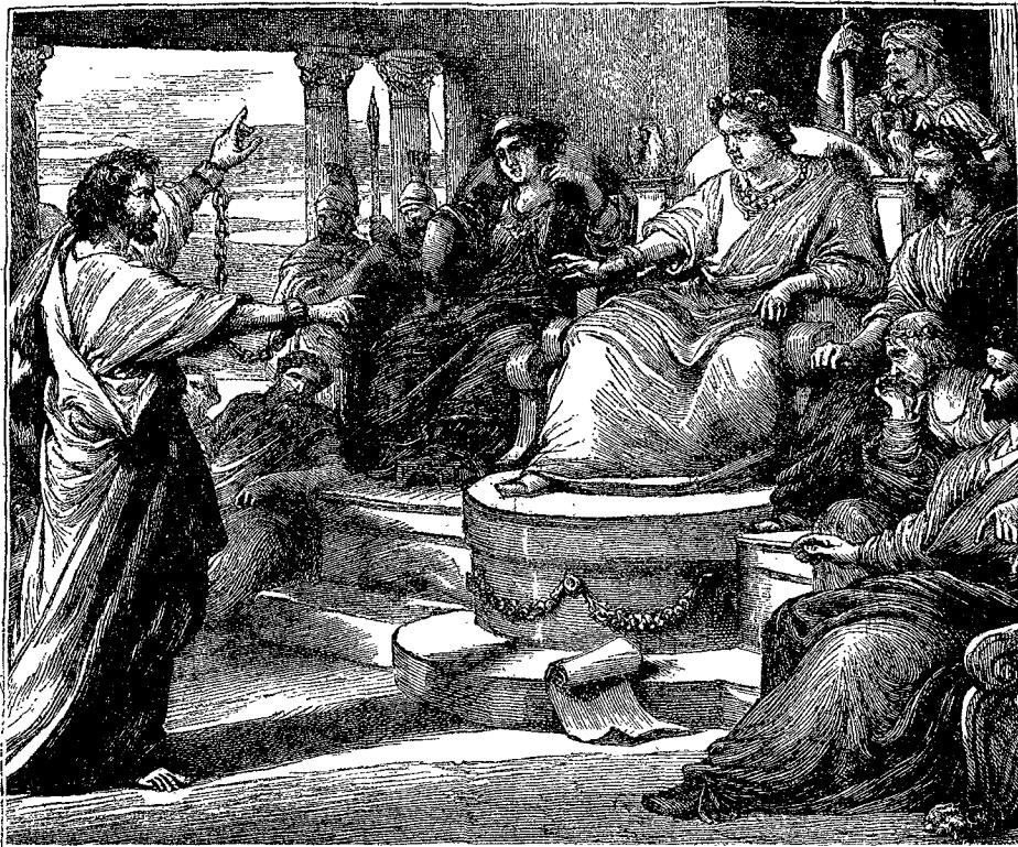
Paul Before Festus: He Appeals Unto Caesar.

Paul and Silas felt that to maintain the dignity of Christ's Church they must not submit to the illegal course proposed by the Roman magistrates. The apostles were Roman citizens, and it was unlawful to scourge a Roman save for the most flagrant crime, or to deprive him of his liberty without fair trial and condemnation. They had been publicly thrust into prison, and now refused to be privately released without proper acknowledgments on the part of the magistrates. 1