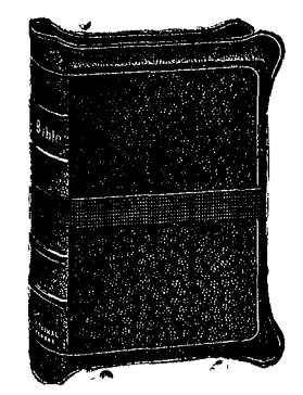
OUR PREMIUM BIBLE CLOSED.

With this book reading is made easy. No more stumbling over the hard words. All proper names are divided into syllables, and the accent and diacritical marks render their accurate pronunciation a simple matter. With a little study of the Key to Pronunciation to be found in every copy of this Bible, the reader loses all fear of the long, hard names of Scripture, and pronounces them with ease.