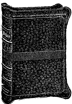
OUR PREMIUM BIBLE CLOSED.

With this book reading is made easy. No more stumbling over the hard words. All proper names are divided into syllables, and the accent and diacritical marks render their accurate pronunciation a simple matter. With a little study of the Key to Pronunciation to be found in every copy of this Bible, the reader loses all fear of the long, hard names of Scripture, and pronounces them with ease.