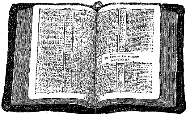
OUR PREMIUM BIBLE OPEN.