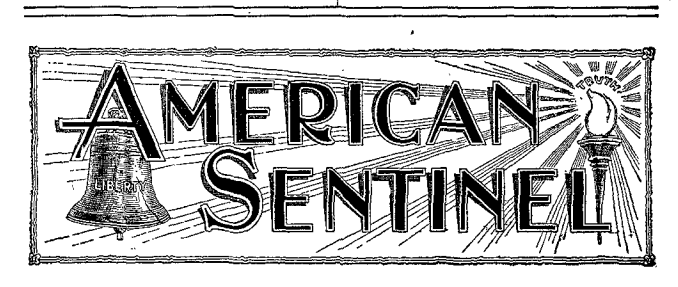
Set for the defense of liberty of conscience, and therefore uncompromisingly opposed to anything tending toward a union of Church and State, either in name or in principle.

Remit by P. O. Money Order, or Express Order, or by Bank Drait on New York. Personal checks are not desired. Make all Orders and Drafts payable to Pacific Press Publishing Co., not to the editor or any other individual. We will receive Postage Stamps in small quantities and any kind of good money. Defaced coins will not be taken. If paper money or coin is sent, register the letter.