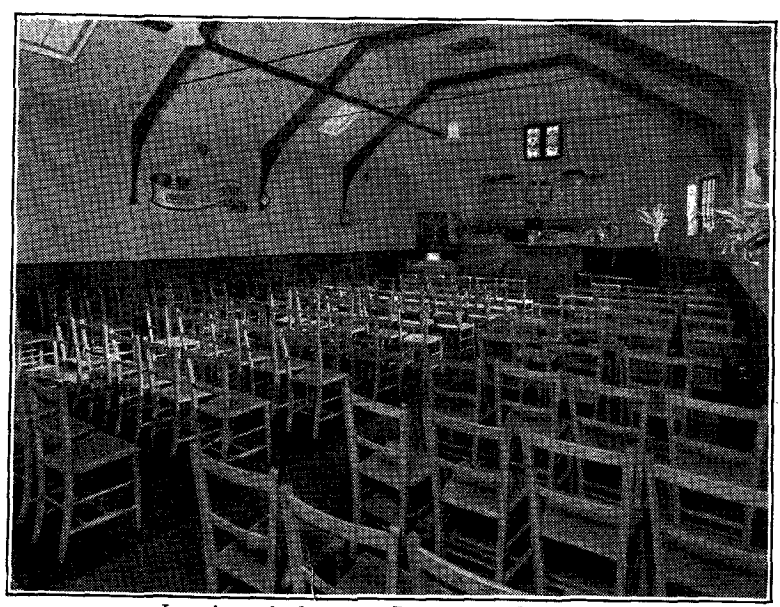
Interior of the new Bournemouth Church.

As a people we must come into a sacred nearness to God. We need the light of heaven to shine into our hearts, and into the chambers of our mind; we need the wisdom that God alone can give. . . . There is a world to be saved: let this thought urge us on to greater sacrifices and more earnest labour for those who are out of the way.—"Testimonies," Vol. 9, page 133.