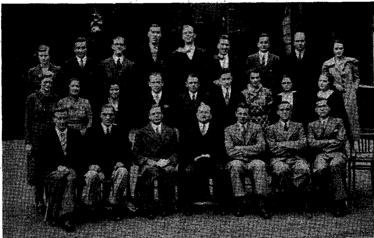
Newbold College Scholarship group, 1938.