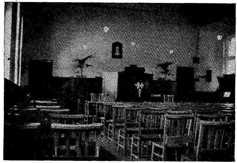
Interior of the new Swansea church.

who all rendered truly magnificent help, everything has been met for under half this figure.