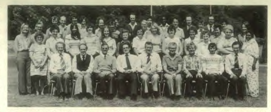
The staff of the Publishing House who have done so much to ensure a successful year in 1977.

report would not have been possible without the full co-operation of The Stanborough Press family, and thanked them for their dedicated service, and willingness to work unsocial hours, and for their help in transferring to other departments in times of pressure. The shareholders were told of the