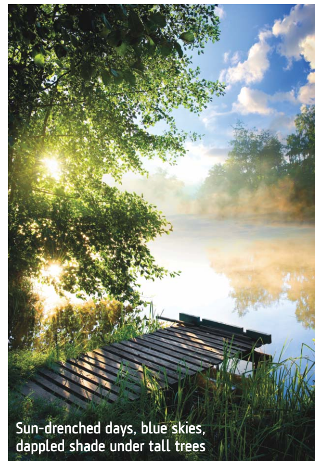
Sun-drenched days, blue skies, dappled shade under tall trees