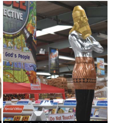
Nummy, Nebuchadnezzar's statue