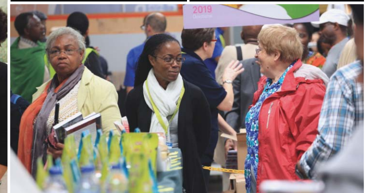
A chance to buy, and a chance to catch up