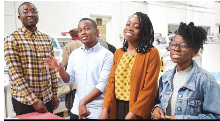
Singing group, Scripture Says

As supplied, errors and omissions excepted