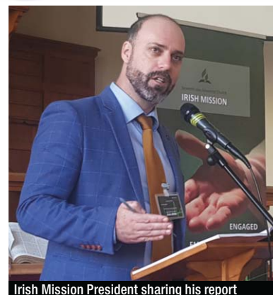
Irish Mission President sharing his report