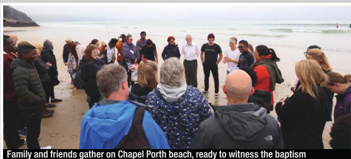
Family and friends gather on Chapel Porth beach, ready to witness the baptism