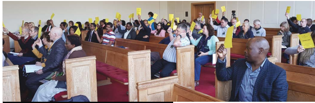
All in favour!