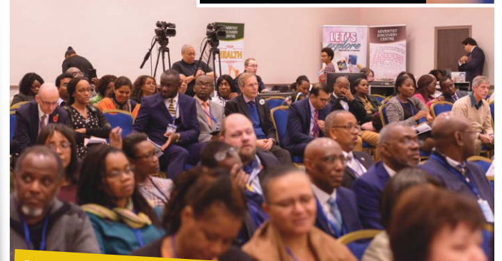
Discipleship and Mission summit participants from around the British Union