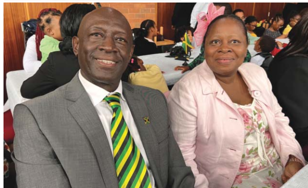
The Jamaican flag colours of yellow, green and black were worn by members of Jamaican descent, and a tasty Sabbath lunch was enjoyed in the warm fellowship of church members, families and friends.

beautiful, contains 400,000 people who are food-insecure, and twelve percent of Jamaicans are Seventh-day Adventists . . . so some members of our church are suffering hunger.