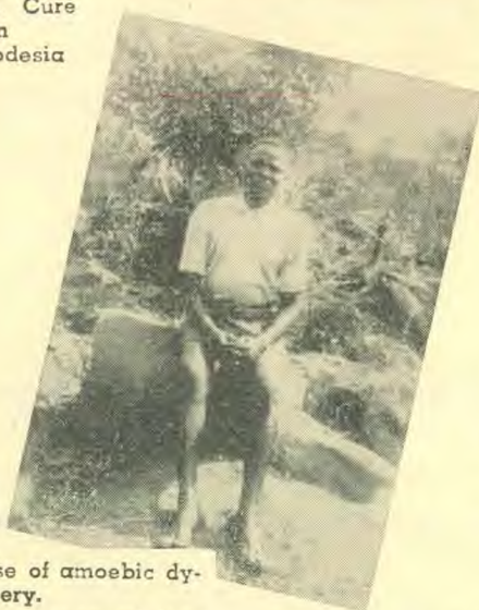
Right.—The same man cured, four months later.