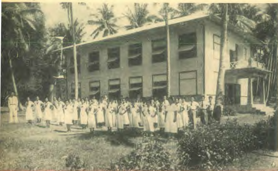
School building and students at West Visayan Academy in the Philippine Islands.