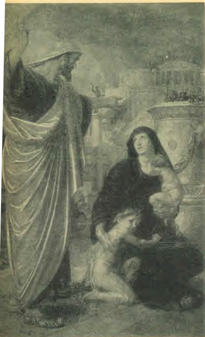
By F. Shields