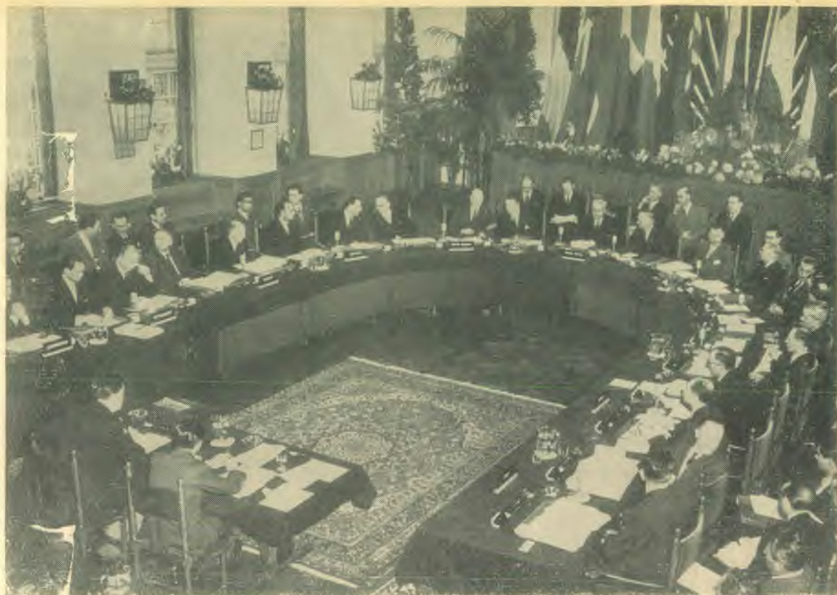
A meeting of the North Atlantic powers at the Hague, Holland.