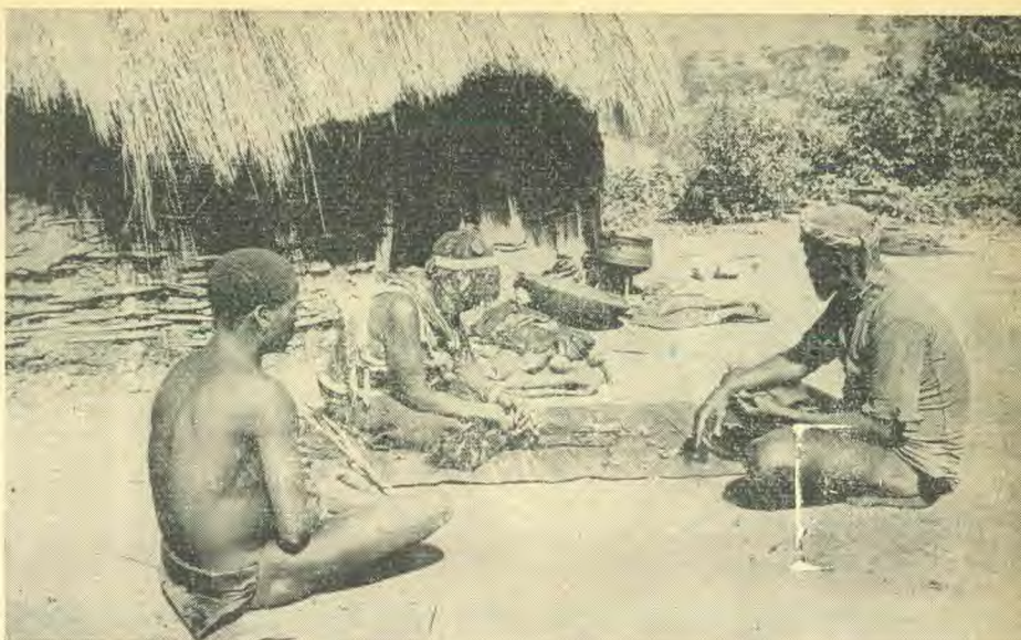
An African Medicine Man.

General Medical Secretary, World-Wide Advent Missions.