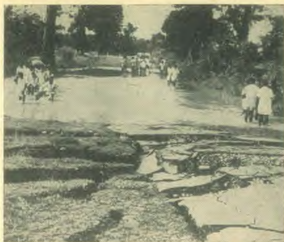
A broken up and flooded road in the Assam earthquake zone.

N ATURE marked the mid-century with one of the greatest earthquakes of all time. More severe than the San Francisco quake of 1906, or even the Japanese quake of 1923, the Assam upheaval of last year actually lifted mighty Mount Everest 198 feet!