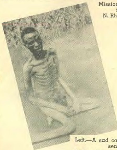
Left.—A sad case of amoebic dysentery.