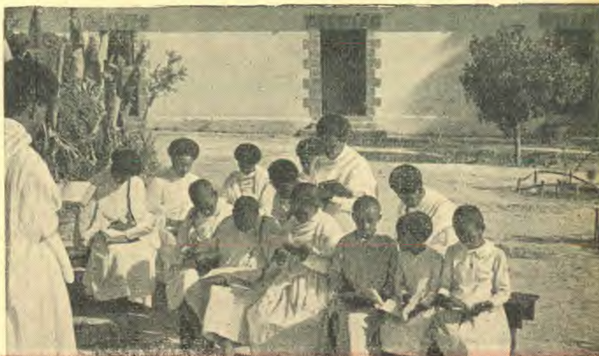
Girls' School at Addis Ababa, Abyssinia.

10/- gifts—many are needed up a new hospital in Karachi, re