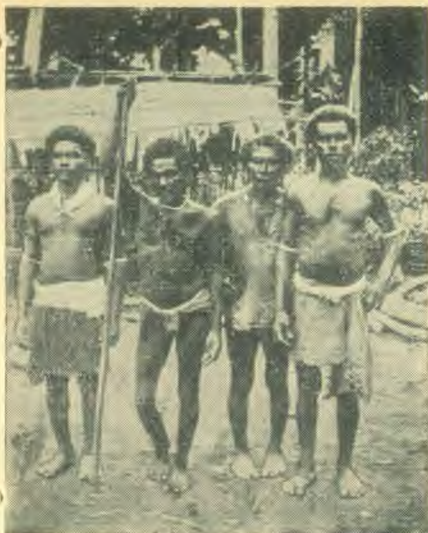
Above. — South Sea Islanders before the coming of the Gospel missionary.