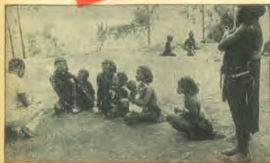
Upper.—African mothers bring their sick children to the missionary nurse.