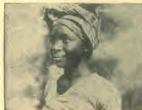
A Nigerian nurse.