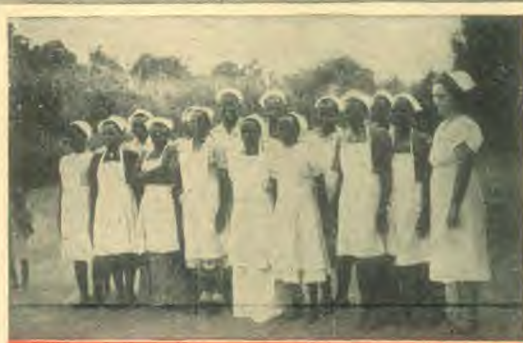
A group of Uganda women, East Africa, who have taken courses in First Aid and Child Welfare.