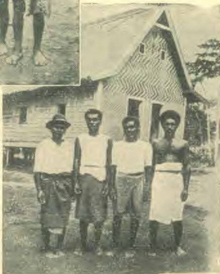
Right. — South Sea Islanders transformed by the influence of the medical missionary.

opening their doors to its medical missions. The vast island fields of the South Pacific are partially occupied by its missionary forces, but this force could be doubled, yes, trebled. In New Guinea alone, one thousand teachers are needed to answer calls. Indonesia, shaken from ancient superstitions and torn by nationalism and disorganized