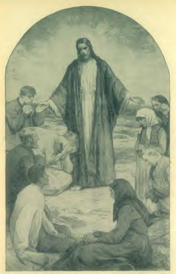
"Come unto Me," bade Jesus

★ JESUS was God from eternity. Jesus was God when He took human flesh upon Himself; Jesus is God now; Jesus will be divine for ever. Were He not so, no-one could be saved.