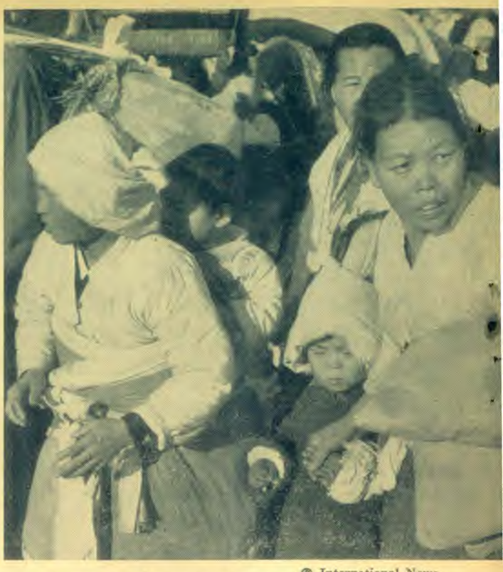
A few of the world's refugee millions in search of shelter and sustenance.

The vision from the living, supreme God that Isaiah, the prophet, saw so filled him with terror at the catastrophes this world would stagger under, that he wrote in ever-to-be remembered words, graphic and powerfully moving: "Behold, the Lord maketh the earth empty, and maketh it waste, and turneth it