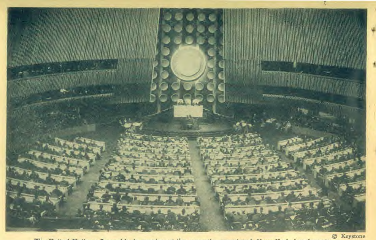
The United Nations Assembly in session at the recently completed New York headquarters.