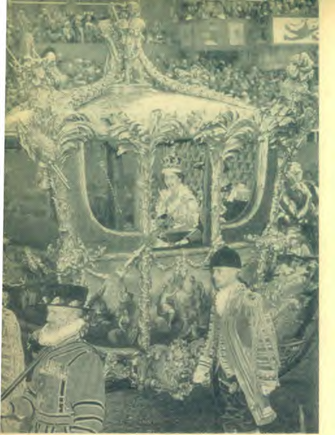
@ International News