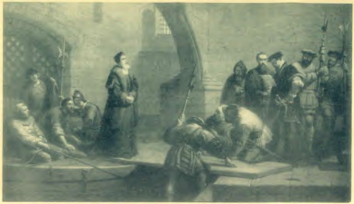
Cranmer was martyred during one of the periods when the English monarch was not "a faithful Protestant,"