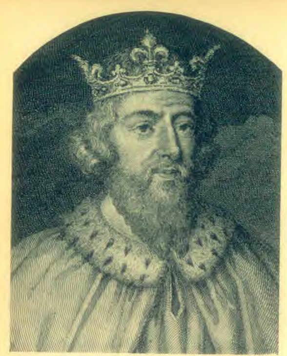
King Alfred the Great translated the Psalter into English.

Nor all sovereigns have a due sense of their obligations to those over whom they rule. Like their subjects, kings and princes are human, with all the inherent weaknesses of the flesh. They may serve themselves instead of serving their people. A monarch takes his governing tasks seriously only as he possesses an enlightened sense of duty. But an enlightened sense of duty can only come to those who acknowledge their allegiance to a higher power. That power we call God. It is a sovereign's awareness of God that creates in him or her the desire to discharge the heavy duties of rulership in the fear of God and the love of mankind.