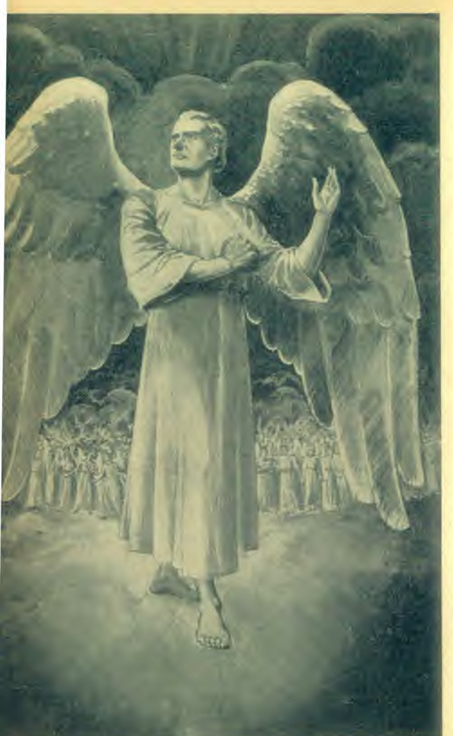
The Bible portrays Satan as a high angel who fell through pride.

How wonderfully mysterious life seems to a child! Every day it whispers a new secret in his ears and thrills him with new excitement at every turn. As he grows older he finds that the things which once came to him with sensational surprise have less attraction. He knows now how they happen. With open-mouthed awe, he once watched a train steam into a station, or saw a telephone switchboard. But when he found out that there was reason and cause behind everything the wistfulness disappeared. He learned the simple rule that there must be a cause to account for every effect.