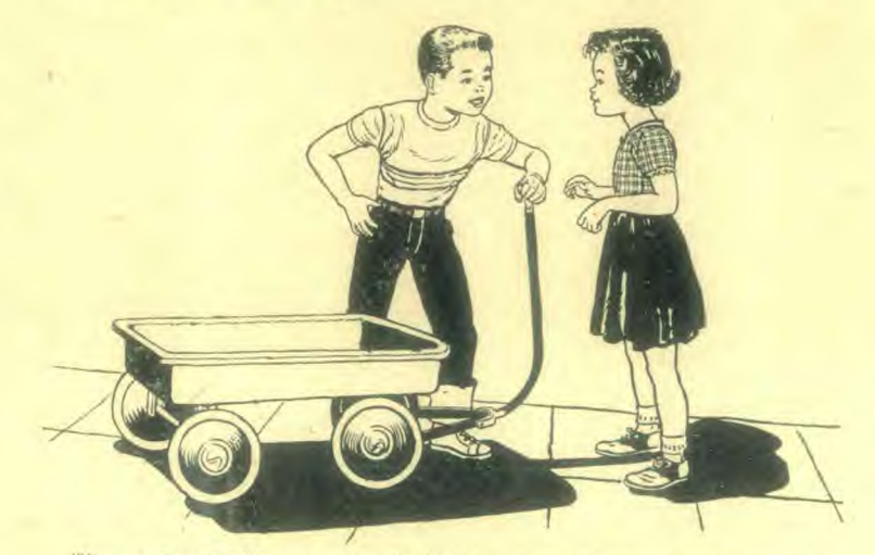
"You see, Anna," Bobby was saying, "to hitch your wagon to a star means to say and do nice things for others."

"You see, Anna, hitching your wagon to a star means to say nice things and to do nice things for others. So I'm going to let you play with my little wagon. I like it better than my other things, but you can play with it."