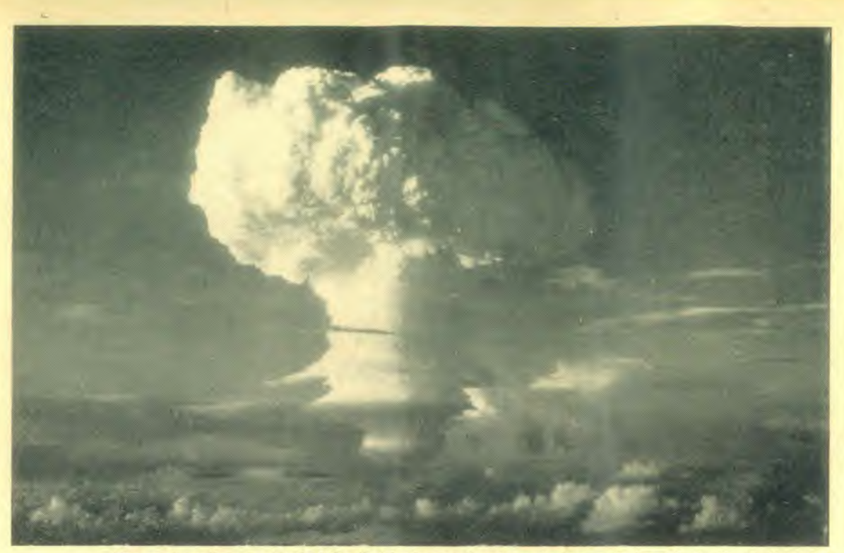
The vast mushroom cloud of the first hydrogen bomb explosion at Eniwetok Atoll.