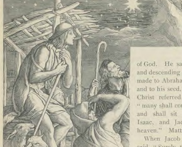
STORY OF BETHLEHEM