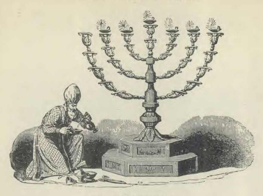
THE GOLDEN CANDLESTICK.

1 Peter 1:6, 7; Heb. 12:6-8. When the candlestick stood complete it represented a good many blows from the hammer of the workman to bring it to perfection. So when the church stands complete they will have passed through fiery trials. (1 Peter 4:12). Who will submit themselves to the hammer of the great Master Workman that they may be blended into one perfect body? The candlestick was only a lampstand. The lamp was the principal object.