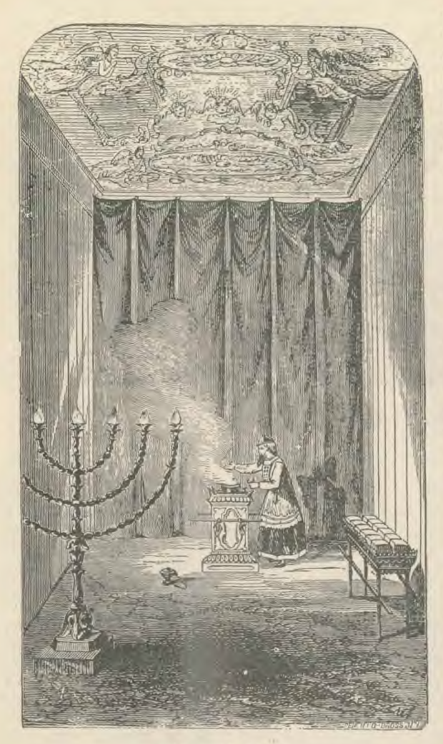
THE HOLY PLACE.