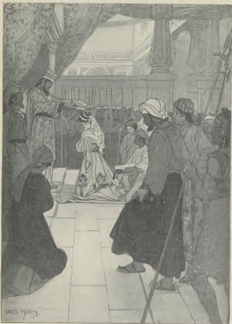
CORONATION OF QUEEN ESTHER.

or the harmony of many homes would be broken.