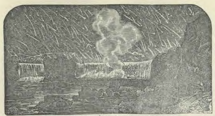
METEORIC SHOWER AS SEEN AT NIAGARA FALLS.

The signs have been displayed in the heavens declaring that the Saviour is soon coming and the end of all earthly governments is near at hand but:—