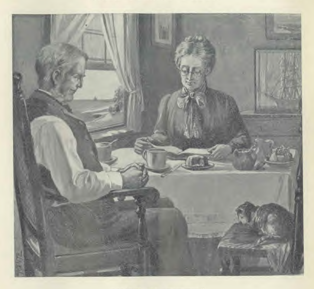
"SEARCH THE SCRIPTURES"