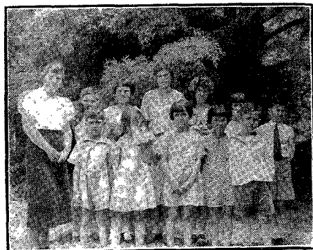
Students of foreign church school, Hongkong, who took part in Campaigns during 1934

I would solicit your prayers in behalf of the activities of this department during this new year, and for each of our faithful church members as they witness for the Master.