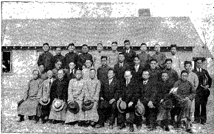
Group of Workers and Laymen, North China Union, who formerly were students in either the old Shanghai School or at China Training Institute

Dear brethren, will you not unite with us in prayer to God that we may have a training institute for our youth of promise in the Chientao Mission?