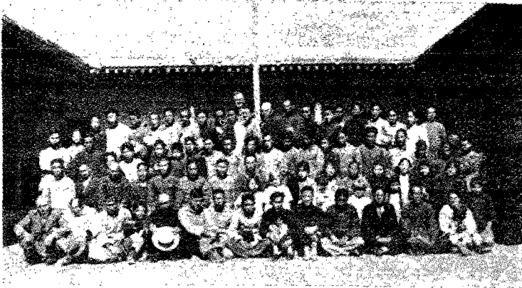
Delegates and Friends in Attendance at the Annual Meeting, Lanchow, Kansu, October, 1935.

when the children of Israel moved forward did God cause the waters of the Jordan to part; it was when the leaders were willing to step into the waters, that God opened the way. It was a sacrifice on the part of the other unions to release a family here, a budget there, and in some cases even to give a part of the base to assist in the creation of this new field; but the Lord has richly blessed as the result. When the "priests" moved forward, God made a road through "Northwest's Jordan."