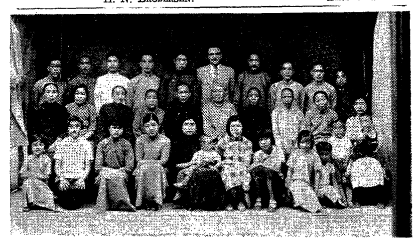
Workers and church members who took part in the evangelistic effort at Tsinan, Shantung.