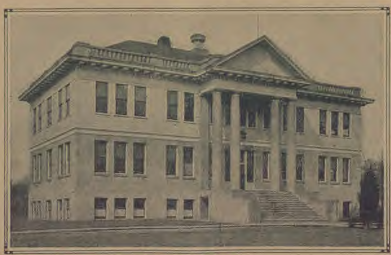
" The Gateway to Service "