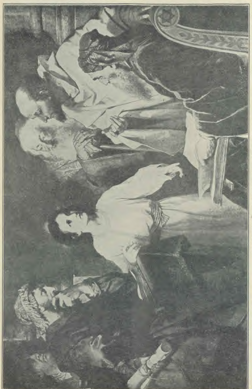
ABOUT HIS FATHER'S BUSINESS