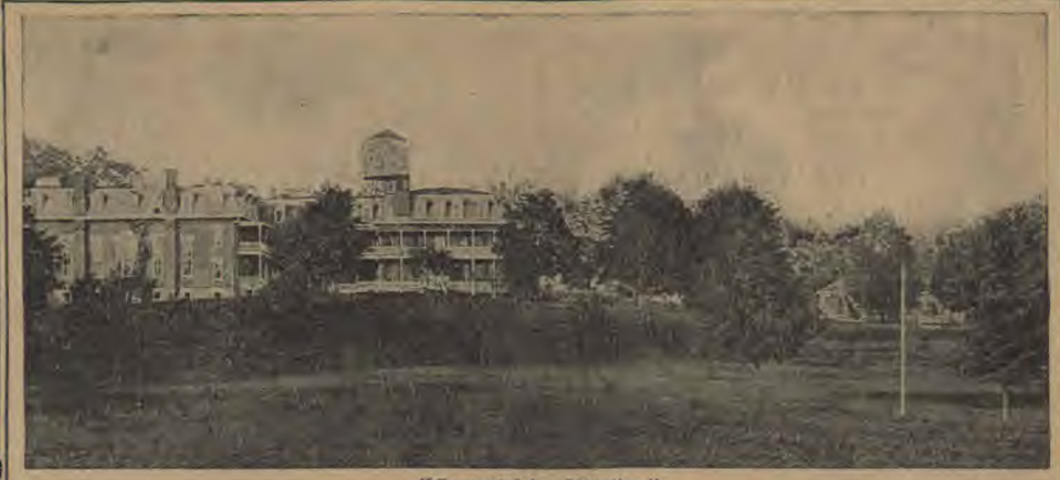
"Beautiful for Situation"