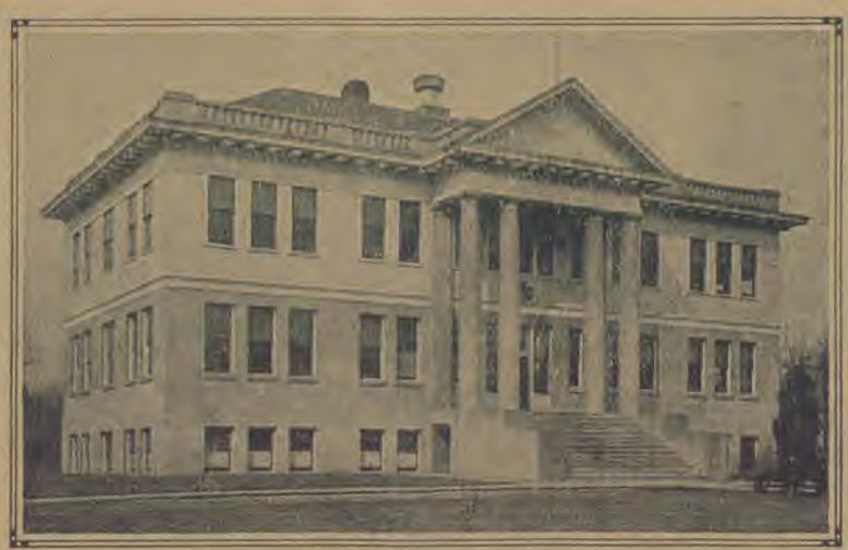
"The Gateway to Service"