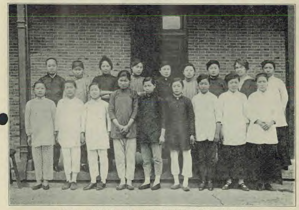
GIRLS' DORMITORY, 1918, CHINA MISSIONS TRAINING SCHOOL

Out of the suffering comes the serious mind; out of the salvation, the grateful heart; out of the endurance, fortitude; out of deliverance, faith.— Ruskin.