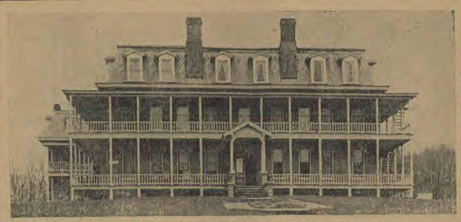
"Beautiful for Situation"